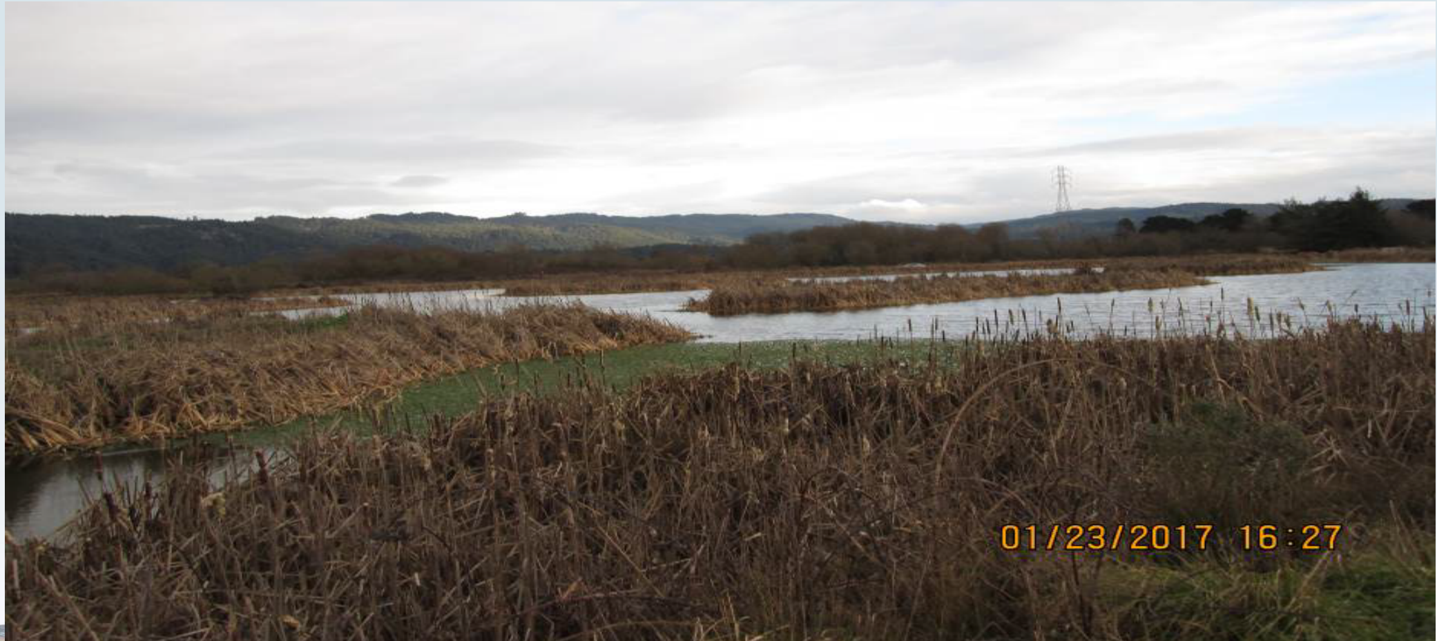
Hauser Marsh in the AMWS